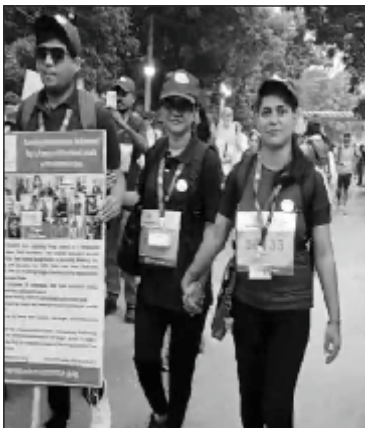
Maya CARE Foundation has successfully participated in Vedanta Delhi half marathon 2023. This year we got very good success. It was just happened with the valuable support from our contributors, volunteers and Bindus.