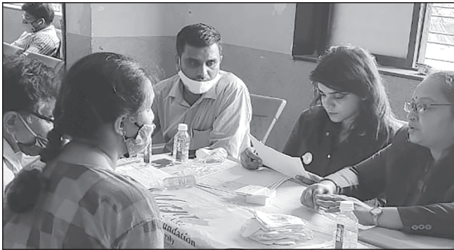
MayaCare Volunteers and Bindu members at a Job fair for disabled in Mumbai.