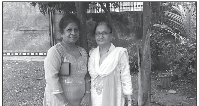
Indore Volunteer Rachnaji took Beneficiary Shrimati Preeti to Visit temple tree plantation.