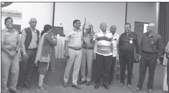
Celebrating Old Age Day on first Octobar at Police Commissioner Pune